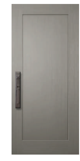
Shaker 1 Panel 6-8 3-0 wide Value Series One panel Shaker style Fir textured door. Shown in Urbane Bronze paint finish option.