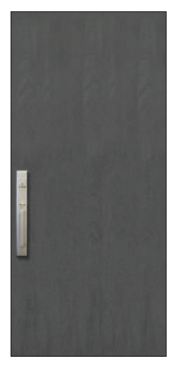
Flush - Mahogany 6-8 3-0 wide Value Series Flush Mahogany textured door. Shown with Perle Noir paint finish.